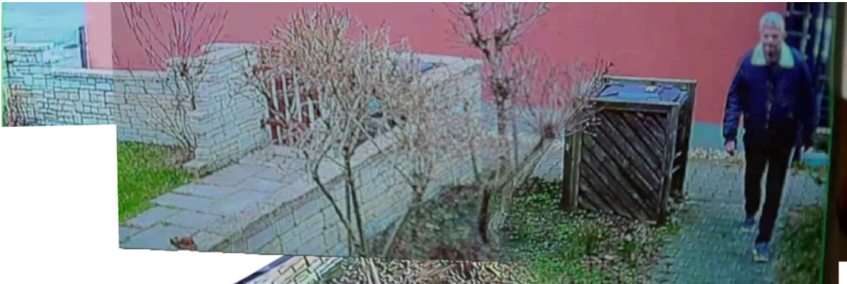
Figure 2. Composite panorama of the front pathway of 'Timmi Allen's' house.

Figure 1 (above) shows a panorama of 'Timmi Allen's' back garden, assembled from enlargements of three screengrabs from the VPRO documentary. This panorama shows his shed, part of his pool, and his boundary hedge and rear garden gate. His garden gate opens onto an alleyway, along which lies a cluster of three distinctive structures and a wooden gate (arranged toward the left-hand side of this panorama). Also visible: A glimpse of asphalt road surface; one neighbour's shed; another neighbour's pool; and two conservatories attached to the house immediately adjacent to Allen's.