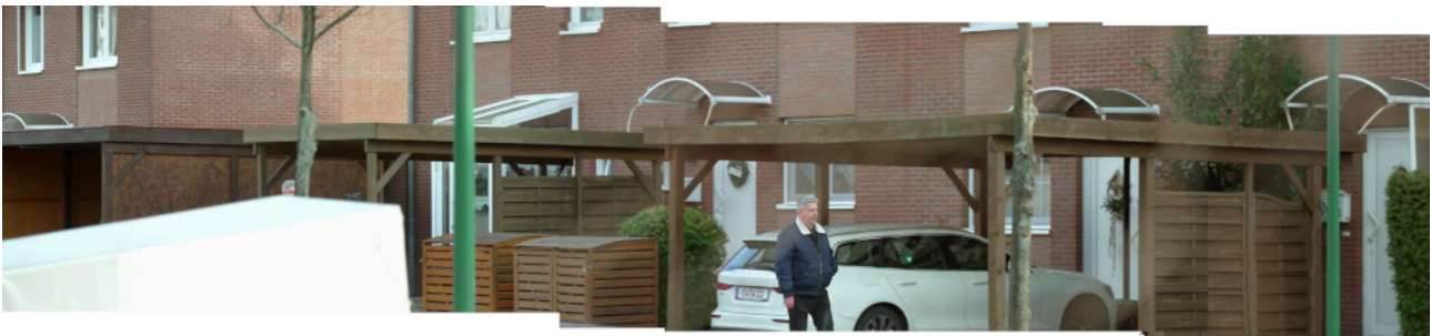
Figure 4. Panoramic composite of an unidentified residential street, presumed to be near 'Timmi Allen's' home. Assembled from VPRO documentary.

By taking screengrabs during this tracking shot, the panorama shown in Figure 4 (below) was assembled. It seemed likely that the residential street seen in the VPRO documentary was near to 'Allen's' home, since he was seen walking along it. The panorama in Figure 4 provided several identification