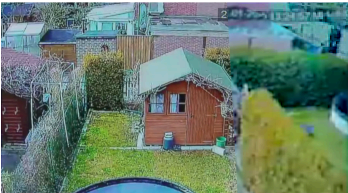
Figure 1. Composite panorama of 'Timmi Allen's' back garden.

The key to identifying Neitsch was provided by a video called 'Spying Then and Now', which was produced by Dutch documentary studio VPRO and published in 2020. This short film shows Neitsch at home, still under the pseudonym 'Timmi Allen', and provides multiple separate views from his domestic CCTV monitoring system. 'Timmi Allen' has cameras stationed at the front and back of his house, and the live feeds from each camera are displayed in a split-screen arrangement on a monitor in his living-room. By taking screengrabs from the VPRO programme, it was possible to use these CCTV feeds to assemble panoramic views of 'Timmi Allen's' front and back gardens. Some of the CCTV cameras were positioned in such a way that they also captured imagery just outside his property. This provided useful details of roads, buildings, and vegetation in the immediate vicinity.