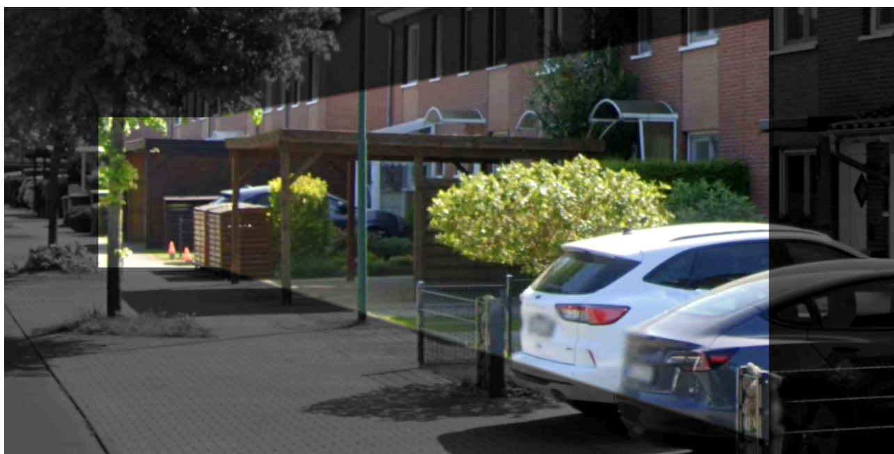
Figure 5. Residential street, in an undisclosed location in Brandenburg, Germany.

In this way, a Brandenburg residential street that was an impressive match for the target street was discovered. The Streetview imagery was captured by Google in May 2022. Several changes had occurred since the VPRO documentary was filmed in January 2020, but conspicuous and non-generic details were apparent in both the Brandenburg site and the street panorama assembled from the VPRO documentary. Inspecting the Brandenburg street in detail, in an attempt to eliminate it from the search, only provided further evidence corroborating the match with the target street. And by a stroke of luck, the white car was parked in exactly the same spot that it had been in January 2020, even though Google had obscured the licence plate. A panoramic view of the identified street is provided in Figure 5 (below), with the areas seen in the VPRO documentary highlighted.