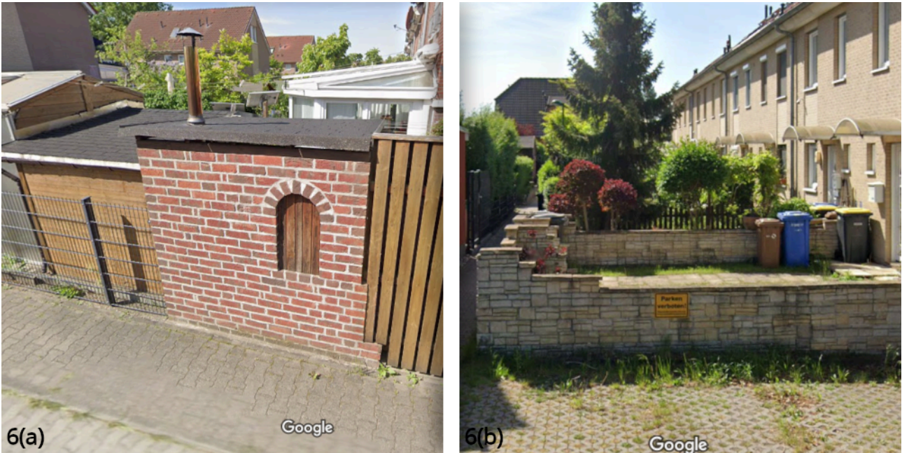
Figure 6. Identifying details of the exterior of 'Timmi Allen's' house, in an undisclosed location in Brandenburg, Germany. Imagery obtained via Google Streetview. 6(a) shows the cluster of distinctive structures in the alleyway behind 'Timmi Allen's' back garden (visible in Figure 1, above). 6(b) shows the distinctive stone wall of his neighbour's front garden (visible in Figure 2, above). The three trees positioned along 'Timmi Allen's' front path can be seen immediately beyond this stone wall.

The remainder of the exterior of 'Timmi Allen's' house is not shown here, which allows him to maintain a reasonable degree of privacy.